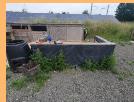
Before & after

Even if you can just do a little, we'll take it!