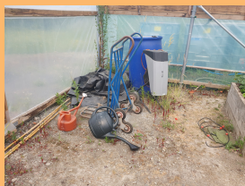
Before & after