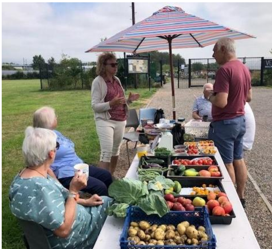
Selling produce at the garden gate, plus tea and a chat!

There are 10 members of the group and they're kept very busy, especially in the spring and summer. Before each season gets going the members sit down and discuss what went well, or not so well, the previous year. What crops were good sellers, anything they had a glut of or needed more of and they plan their planting and sowing accordingly. The group use Polytunnels 1 and 2 for propagating and growing. Check out the fabulous tomatoes in Polytunnel 2 – they look and taste amazing and are available for sale. They also have just over 20 outside beds to weed, water and harvest. This number may reduce next year, though, so that there are more beds available for members.